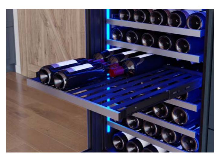
Full-Extension Wood Racks