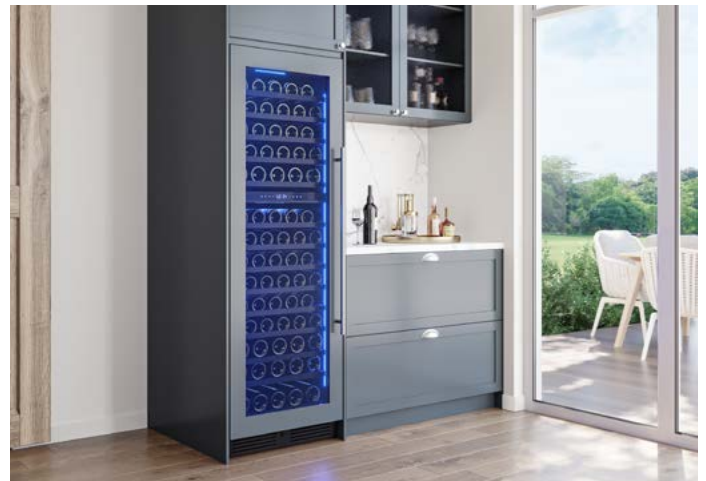
Accommodates custom wood overlay panels