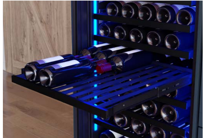
Full-Extension Wood Racks