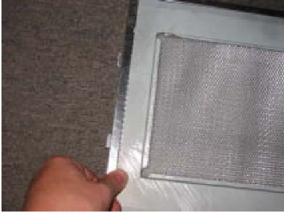
2. Push two corner tabs into metallic filter frame to lock it in. If pushing tabs in is difficult, gently lift up on the corner lip of the bracket near the gray handle and push down on the corner tab.