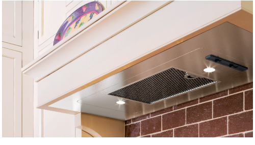
TORNADO I POWER PACK (AK81)

A power pack with a wireless remote control, adjustable-depth liners in 36" and 42" widths and professional baffle filters to enhance performance. Size: 29" CFM: 1.000