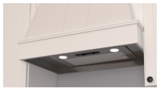
TORNADO MINI POWER PACK (AK84)

This 600–CFM power pack features dual-level halogen lighting, 3–speed blower, a decorative stainless steel filter and an angled housing unit for a better fit with any built-in canopy. An adjustable depth liner is also available. Size: 27" CFM: 600