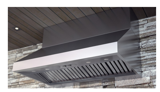
CYPRESS WALL OUTDOOR (AK78)

The updated Cypress features a 304-grade stainless steel polished body, two speed metallic knob controls, duallevel halogen lighting and an extended 32" depth for even more capture. Optional 12" duct cover accessory. Size: 36", 42", 48", 54" CFM: 1,200