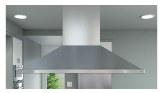
SIENA PRO ISLAND (ZSL)

With it's classic, professional-style design Siena Pro Island is equipped with a 1,200-CFM blower, hybrid baffle filters and Zephyr's ICON Touch® controls. Size: 42", 48" CFM: 1,200