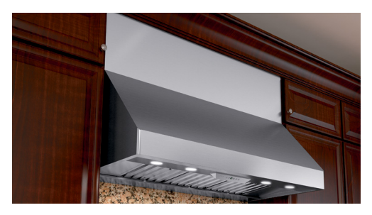
TEMPEST II WALL (AK75)

Designed with professional-grade performance and seamless contours, the wall–mount Tempest II gives you serious cooking power with 650-CFM or 1,200–CFM blower options. Available with ACT™ technology. Size: 30", 36", 42", 48" CFM: 1,200, 650, 390, 290