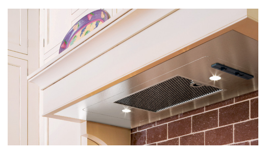
TWISTER POWER PACK (AK80)

The updated Cypress features a 304-grade stainless steel polished body, two speed metallic knob controls, duallevel halogen lighting and an extended 32" depth for even more capture. Optional 12" duct cover accessory. Size: 36", 42", 48", 54" CFM: 1,200