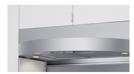
TAMBURO UNDER-CABINET (ZTA)

A fresh approach that's designed for real life, this original comes equipped with halogen lighting, 3-speeds and an adjustable utensil bar.