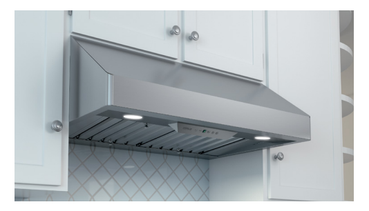
TEMPEST I UNDER-CABINET (AK70)

A discreet, European-style, professional-looking range hood, Gust adds fashion and function to under-cabinet installations. An adjustable utensil bar keeps utensils within easy reach. Also available with baffle filters. Size: 30", 36" CFM: 400, 290