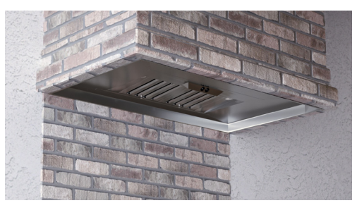
WILLOW POWER PACK OUTDOOR (AK88)

Willow's high performance professional stainless steel baffle filters enhance airflow, while being corrosion resistant and dishwasher-safe. 2-speed, rocker controls withstand extreme heat and moisture. Optional, adjustable-depth 304-grade liners are available in 36", 42", 48", 54" and 60" widths. Select either 304-grade stainless steel or galvanized steel with gray powder-coat protection. Size: 29" CFM: 1.000