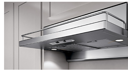
TERAZZO UNDER-CABINET (ZTE)

Boasting the ideal combination of style, convenience and innovation. With its 12-inch cabinet mounting depth and ingenious terraced display rack, it's the perfect addition to any kitchen.