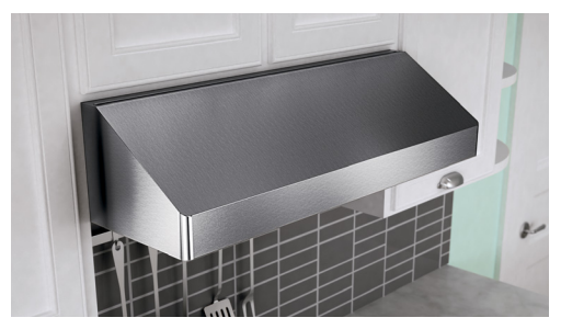
GUST UNDER-CABINET (AK71)

A discreet, European-style, professional-looking range hood, Gust adds fashion and function to under-cabinet installations. An adjustable utensil bar keeps utensils within easy reach. Also available with baffle filters. Size: 30", 36" CFM: 400, 290