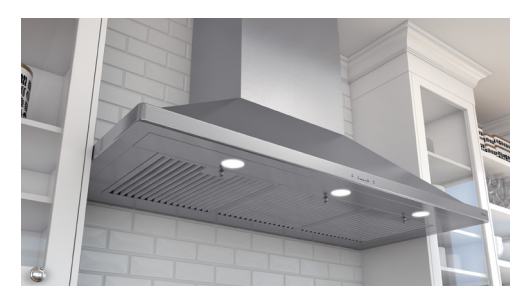
SIENA PRO WALL (ZSP)

With it's classic, professional-style design Siena Pro is equipped with a 1,200-CFM blower, hybrid baffle filters and Zephyr's ICON Touch® controls. Clean, efficient power is just a touch away.