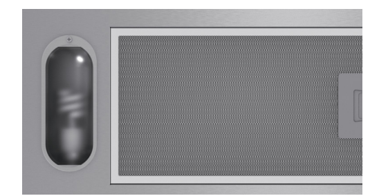
TWISTER ES POWER PACK (AK80-ES)

The 3-speed 290-CFM Twister ES hides the ventilation you need beneath your custom, built-in canopy. An optional stainless steel liner extends the hood and protects your cabinetry. ENERGY STAR approved with warm white fluorescent lighting.