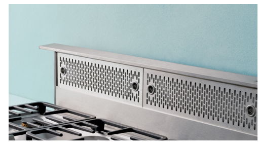
SORRENTO DOWNDRAFT (DD1)

Ideal for small kitchens or island settings where ceilings are too high for ducting, Sorrento rises to the occasion as a downdraft hood option.