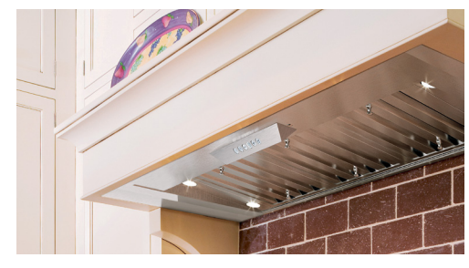
TORNADO III POWER PACK (AK83)

Tornado III takes the typical power pack up a notch, with multiple blower options to meet the most demanding chef's requirements. 3-speed electronic controls and wireless remote control put you in command. An adjustable depth liner is also available.