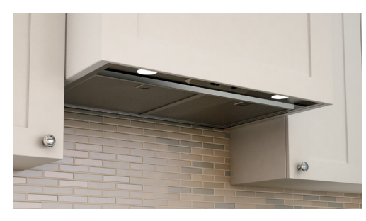
MONSOON MINI (AK91)

Willow's high performance professional stainless steel baffle filters enhance airflow, while being corrosion resistant and dishwasher-safe. 2-speed, rocker controls withstand extreme heat and moisture. Optional, adjustable-depth 304-grade liners are available in 36", 42", 48", 54" and 60" widths. Select either 304-grade stainless steel or galvanized steel with gray powder-coat protection. Size: 29" CFM: 1.000