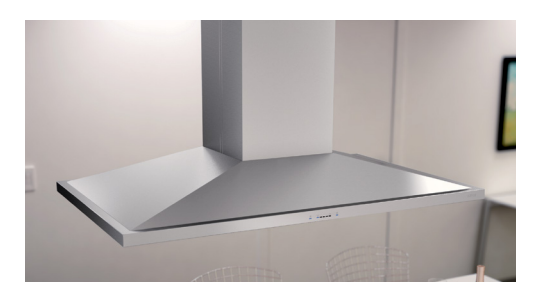
ANZIO ISLAND (ZAZ)

Anzio's 600-CFM blower, ICON Touch® controls, dual-level halogens and Quick-Lock installation system put it a step ahead of the competition. Available with ACT ^{\tiny \text{TM}} technology.