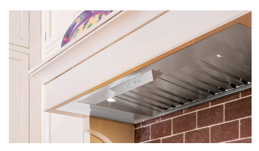
TORNADO II POWER PACK (AK82)

A power pack with a wireless remote control, adjustable-depth liners in 36" and 42" widths and professional baffle filters to enhance performance. Size: 29" CFM: 1.000