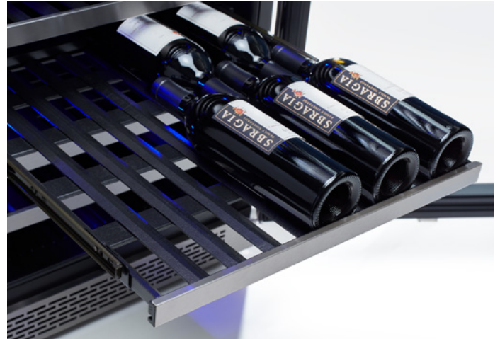
Full-Extension Wood Racks